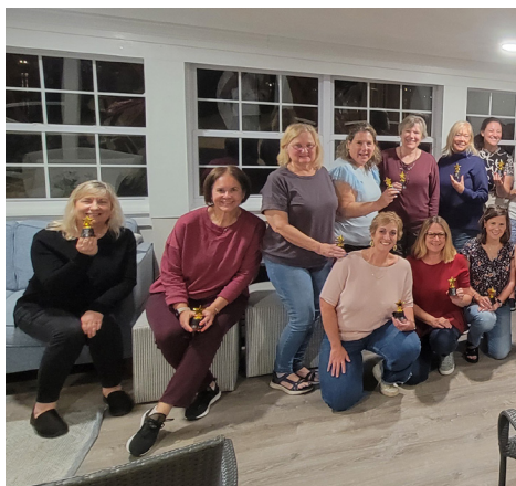
Pictured above & below: The Indian Lake Women's Club "Thank You" Dinner