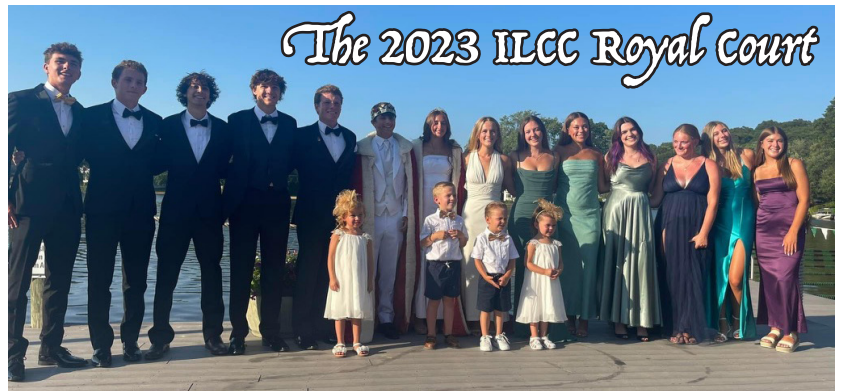
The 2023 ILCC Royal Court