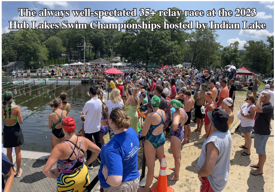
The always well-spectated 35+ relay race at the 2023 Hub Lakes Swim Championships hosted by Indian Lake