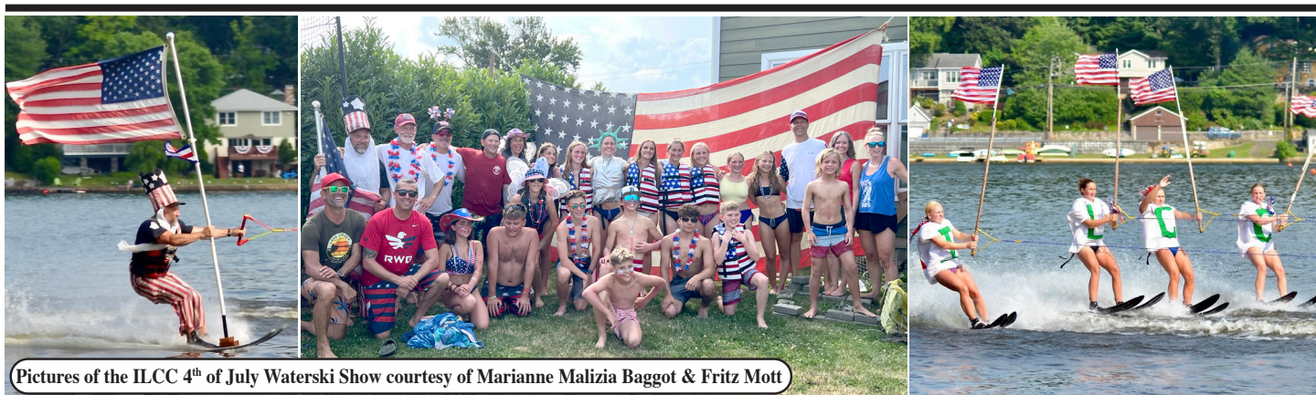
Pictures of the ILCC 4 th of July Waterski Show