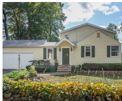
46 Longview Trail SOLD for $476,000