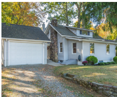
84 East Shore Road SOLD for $324,025