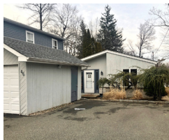
46 Seneca Trail SOLD for $354,500