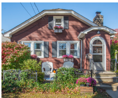
69 Sunset Trail SOLD for $365,000