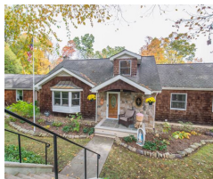
36 Hussa Place SOLD for $615,000