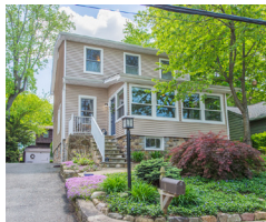
42 East Shore Road SOLD for $475,000