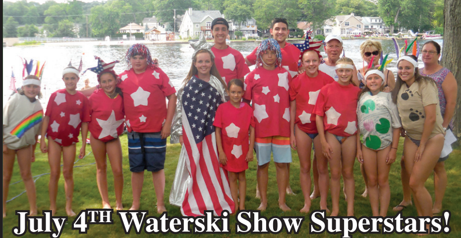
July 4 TH Waterski Show Superstars!