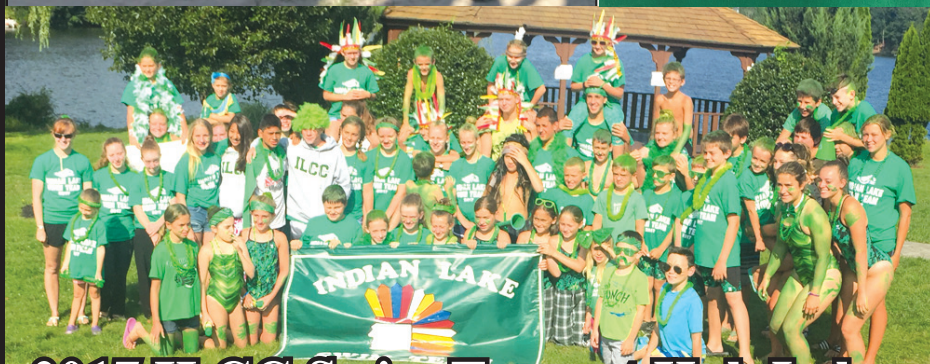
2017 ILCC Swim Team at Hub Lakes