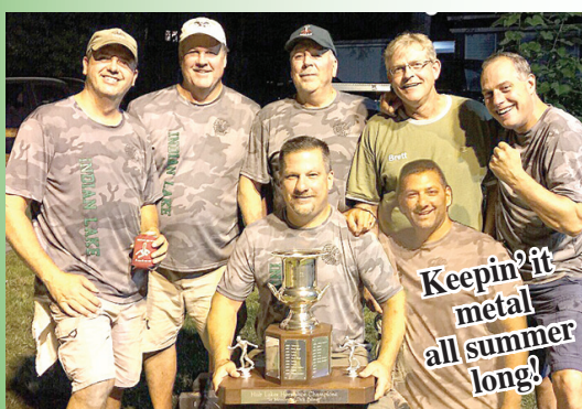
Congratulations to the 2017 ILCC Men's Horseshoe Team on their win over Rock Ridge in the final championship match!