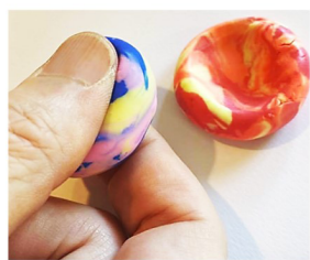
Handmade Worry Stones

They Might be Big Words, But These Indian Lake Kids Know the Meaning of Both!